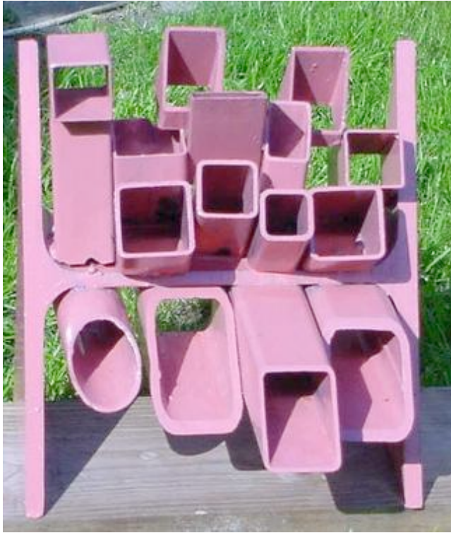
L.f.w. Sterk: "earth" - Sculpture Ceramic, 2003